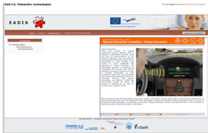
Figure 3 - Example of a Telematics Technology Block C object.

It expected that you might begin the training programme with developing familiarisation of the Field of Telematics. This Block B unit helps the learner to appreciate some first principles of telematics through exploration of the landscape of telematics technology. From there, depending on the learners focus they may be directed to Telematics Technologies (Block C) to build upon technological awareness. The user can then relate technological knowledge to its context of use e.g. have gained deeper insight into technological evolution, societal and environmental impact, the roots of computing and information sciences, as well as future directions and possibilities.